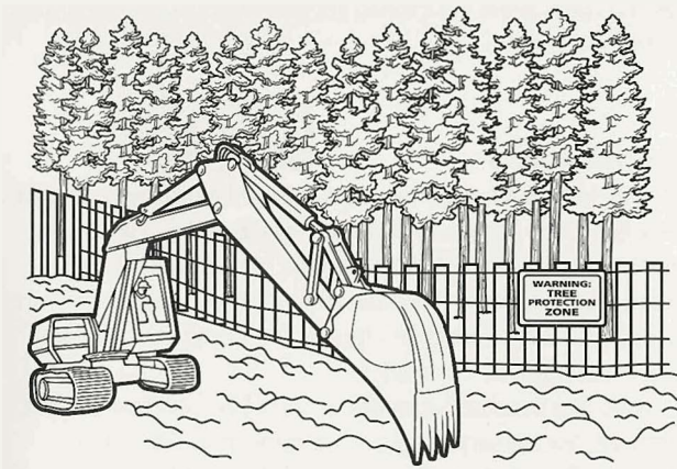
Protective fences should be erected as far out from the trunks as possible in order to protect the root systems.

Sometimes small changes in the placement or design of your house can make a great difference in whether a critical tree will survive. An alternative plan may be more friendly to the root system. For example, bridging over the roots may substitute for a conventional walkway. Or, instead of trenching beside a tree for utility installation, tunneling under the root system is much less damaging.