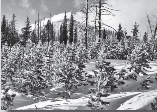
Sherman Peak, One Proposed Wilderness Area in the Kettle Range in the Colville National Forest

The subject of forest planning used to put me to sleep. In the past, Forest Plan revisions have been fruitless efforts resulting in plans no one was happy with. But, plans expire and forests in our region are at it again. The Colville National Forest is trying something different this time – collaboration. Over the past year we have met with the diverse users of the forest and tried to find common ground on tough issues like sustainable logging, motorized and non-motorized recreation, and Wilderness. A measure of the progress the collaborative group has achieved occurred in January, when nearly everyone involved supported new Wilderness areas on the Colville Forest, and a majority supported Wilderness protection for over 200,000 acres of the million-acre forest!