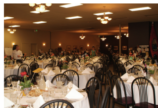
Help us fill these chairs with new Lands Council members!

Benefit Breakfast committee members will be contacting you to see if you are interested. Please respond to Amber at 509-838-4912 or awaldref@landscouncil.org .